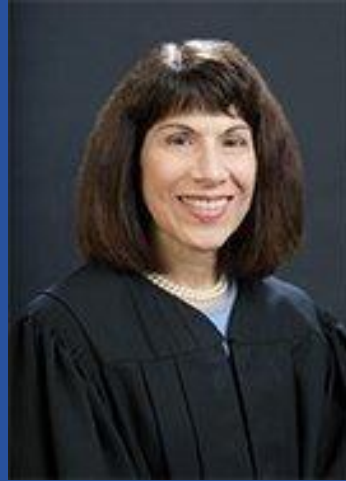
District Judge Beth Labson Freeman

United States District Court for the Northern District of California