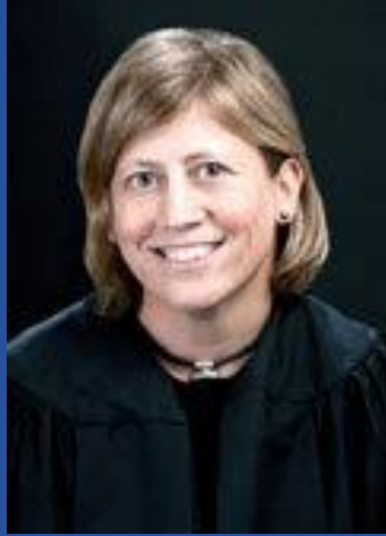
Magistrate Judge Laurel Beeler

United States District Court for the Northern District of California