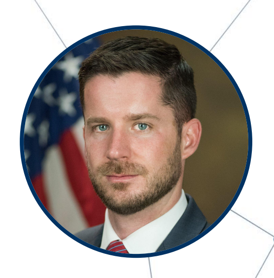
Connect with Hunter on:

Hunter Deeley serves as an Assistant Bureau Chief for the FCC Enforcement Bureau, with responsibility for helping supervise all enforcement matters that directly or indirectly implicate national security. Previously, he served in the National Security Division's Foreign Investment Review Section (FIRS). While there, Hunter reviewed and investigated over 200 transactions filed with the Committee on Foreign Investment in the United States (CFIUS).